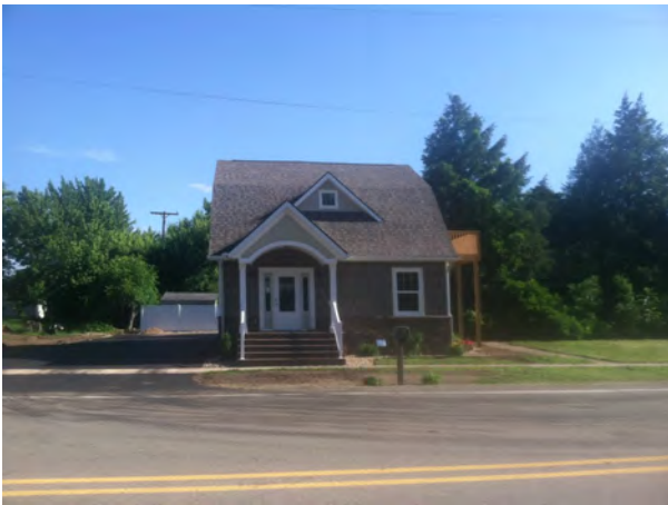
Salon Harlow 119 E. Eliza St.