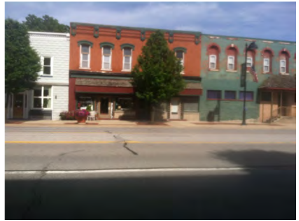
Vintage Gifts 222 N. Grand St.