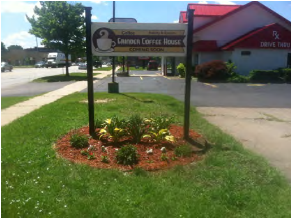
Grinder Coffee House 321 N. Grand St.— Coming Soon